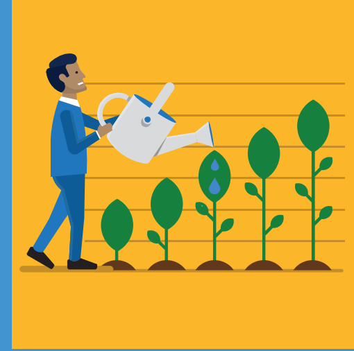
Start and grow easily

Connect your people and processes like never before