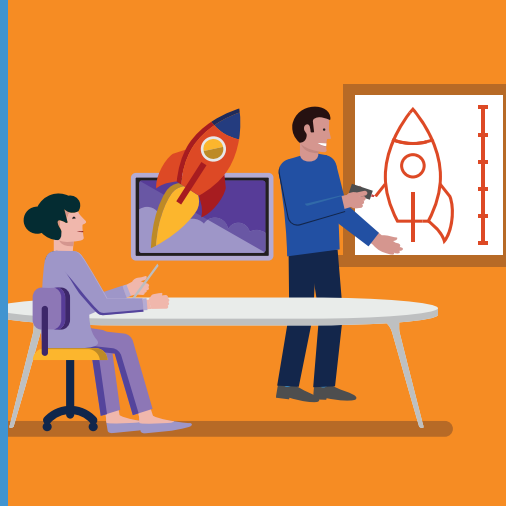
Make smarter decisions