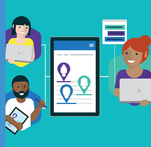
Connect your business

From day one, Microsoft Dynamics 365 Business Central makes managing financials, sales, service and operations easier and faster.